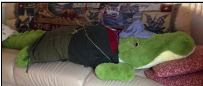
Gator came to Rusk ready to ride the Texas State Railroad!