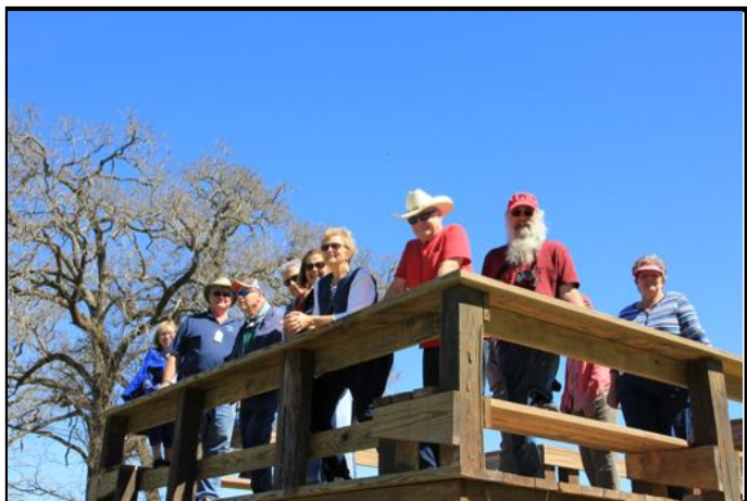
The group at Caddo Mounds