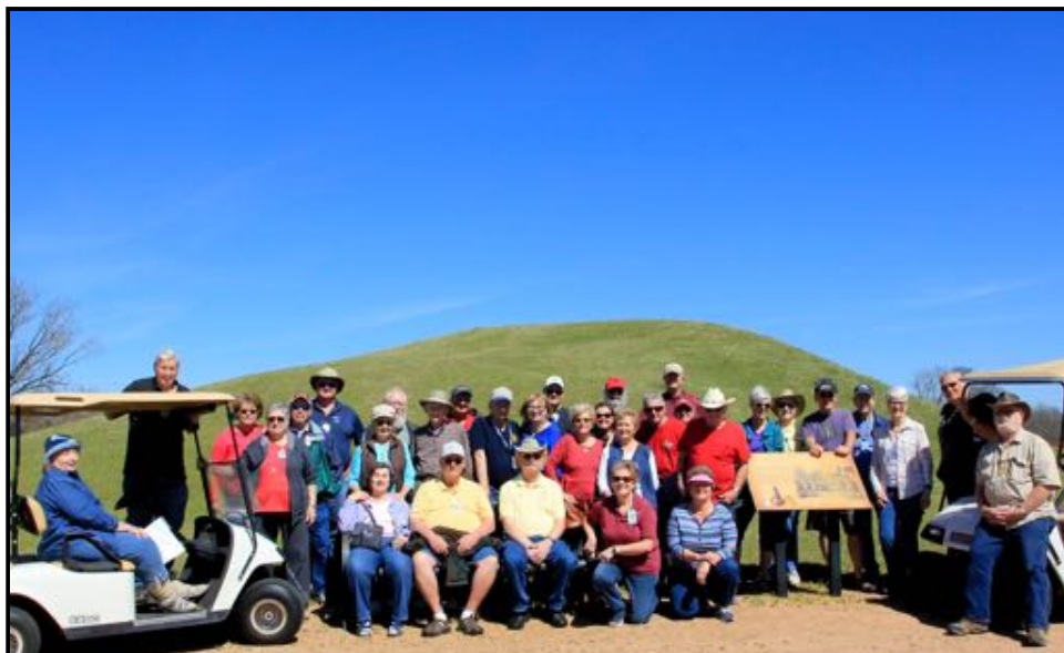
Our TCPU Group at Caddo Mounds