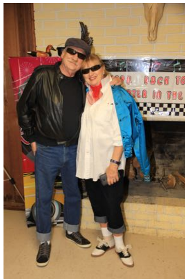
Rocking the 50s in Style