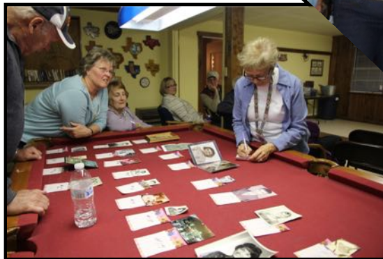
Guess Who It's harder than you think!