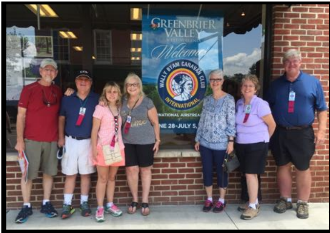
Lewisburg welcomed WBCCI