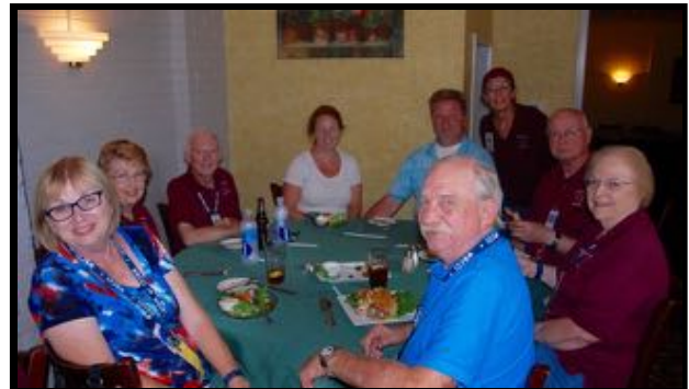
TCPU Luncheon at Food & Friends