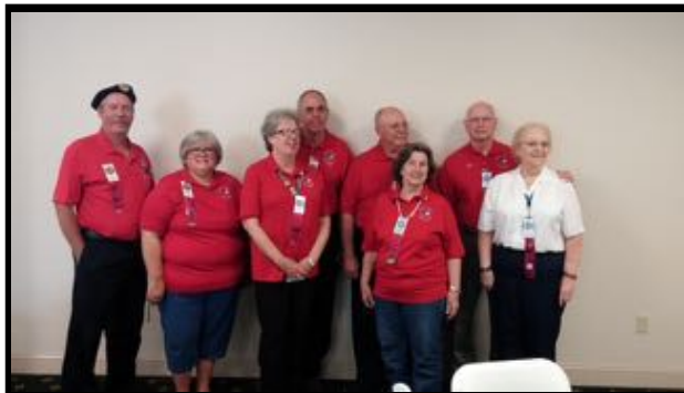
2016 and 2017 Region 9 Officers