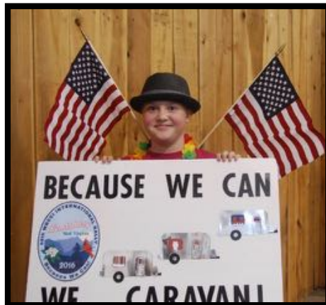
Our parade theme was, Because We Can—We Caravan! Our entry took 2nd place!