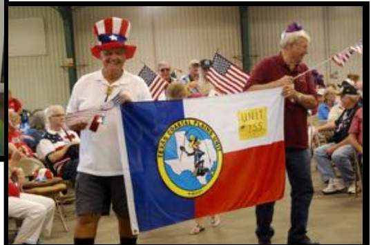
Our TCPU Parade Leaders