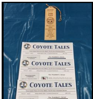
Honorable Mention for Coyote Tales