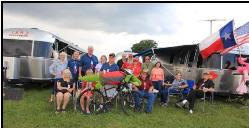
Another fun gathering at International