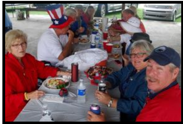
TCPU 4th of July Picnic