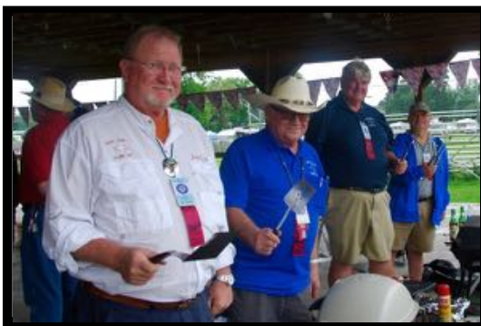
4th of July Chefs