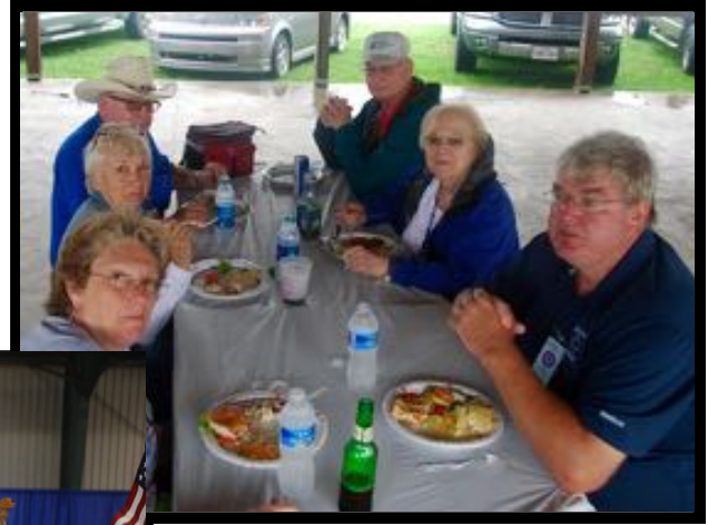
Millers and Bundys 4th of July Picnic