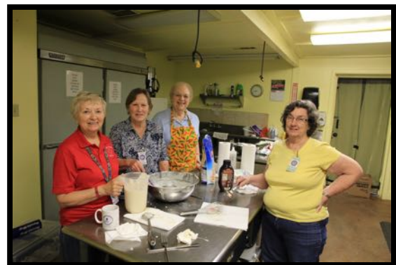
The Waffle Experts