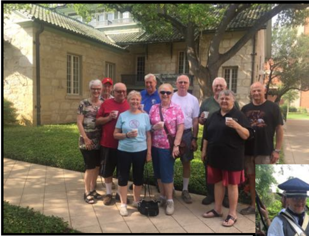
This group enjoyed a wonderful breakfast at the Guenther House, home of Pioneer Flour Mills.