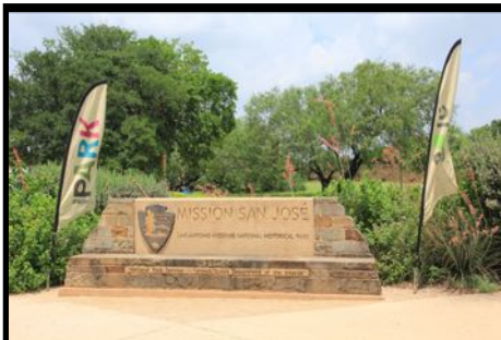
Above: Mission San Jose, 1720, and National Historic Park Visitor's Center