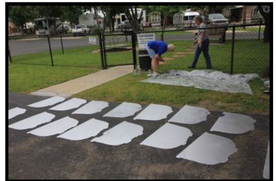
Our little Airstreams getting a coat of paint in preparation for the International parade.