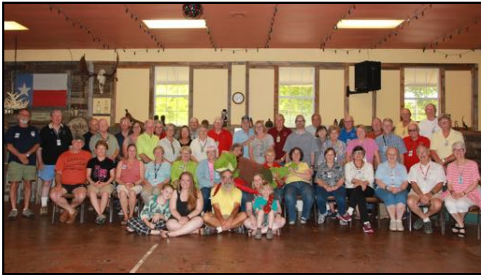
Our Fine Looking TCPU Memorial Day Rally Group