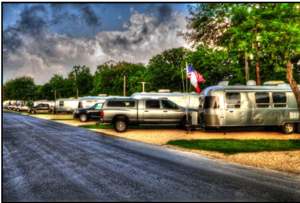
OUR AIRSTREAM LINE UP