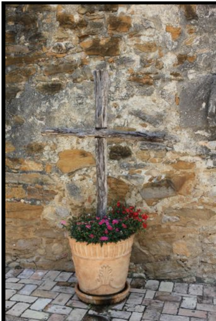
Mission Espada, 1731