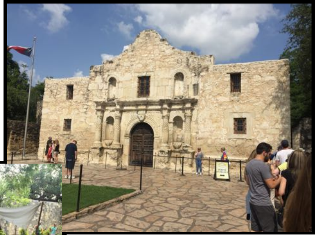
The Alamo 1718