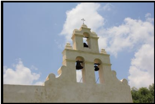
Mission San Juan Capistrano, 1731