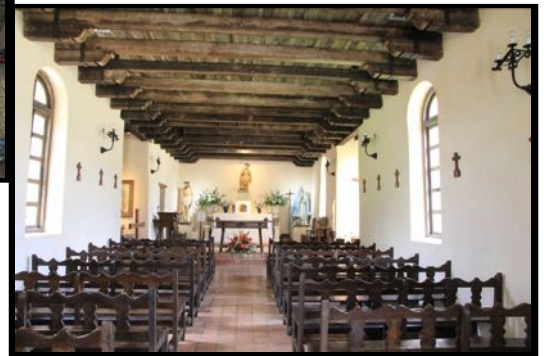
Interior, Mission Espada