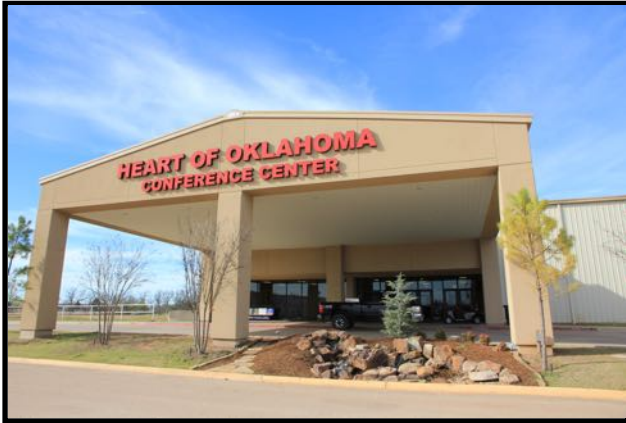
Heart of Oklahoma Conference Center Shawnee, OK