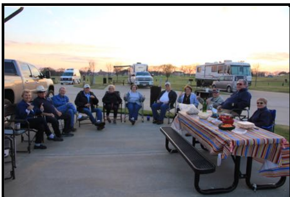
Happy Hour at the Casino