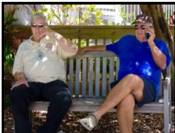
We had to keep a close eye on these two mischievous guys!