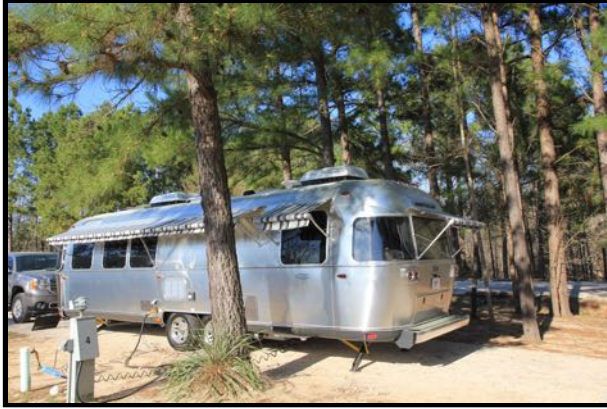
Silver amongst the pines!