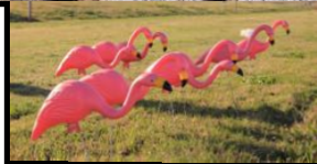
Scenes from the Skit Introducing Airstream Aloha, 2017 "Gilligan's Island"