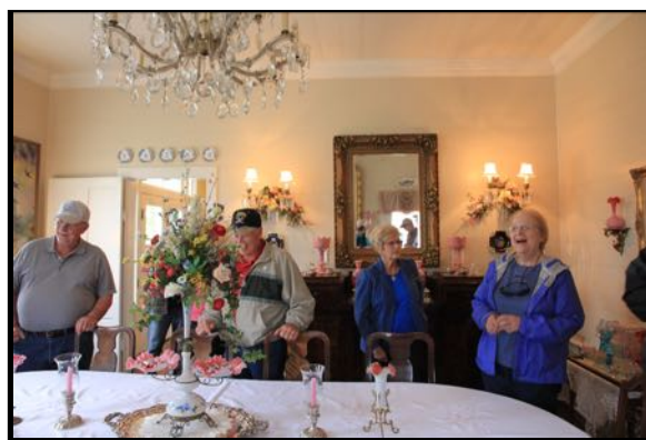
Roseland Plantation was beautiful inside and out.