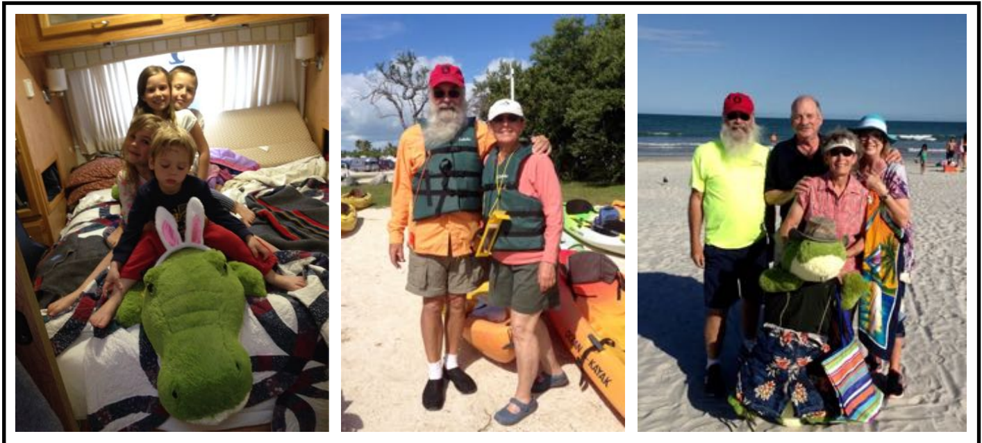
The kids dressed me in bunny ears for Easter!

Now to share a few of those pictures of my exciting adventures!