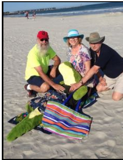
Hanging out with the Beach Bums!