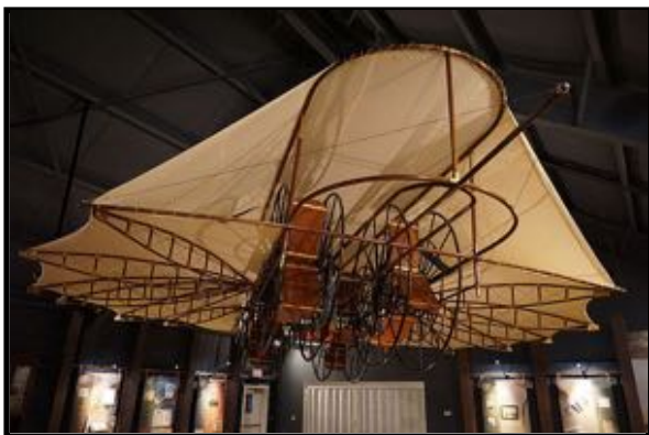
The Ezekiel Airship in Pittsburg