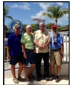
Guys at the Dolphin Research Center