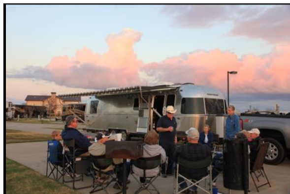
The rain clouds finally parted!