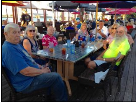
I told you they ate out a lot!