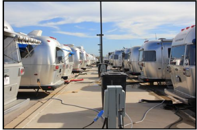
Lots of silver in Shawnee