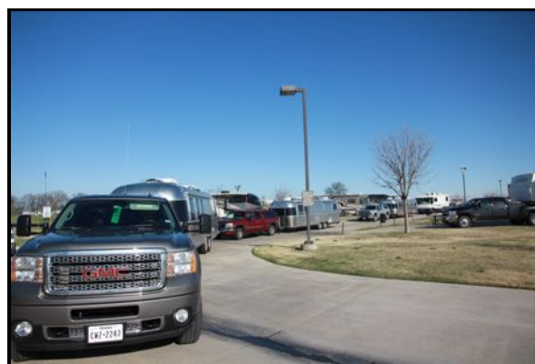
All hitched up and ready to roll to Region 9