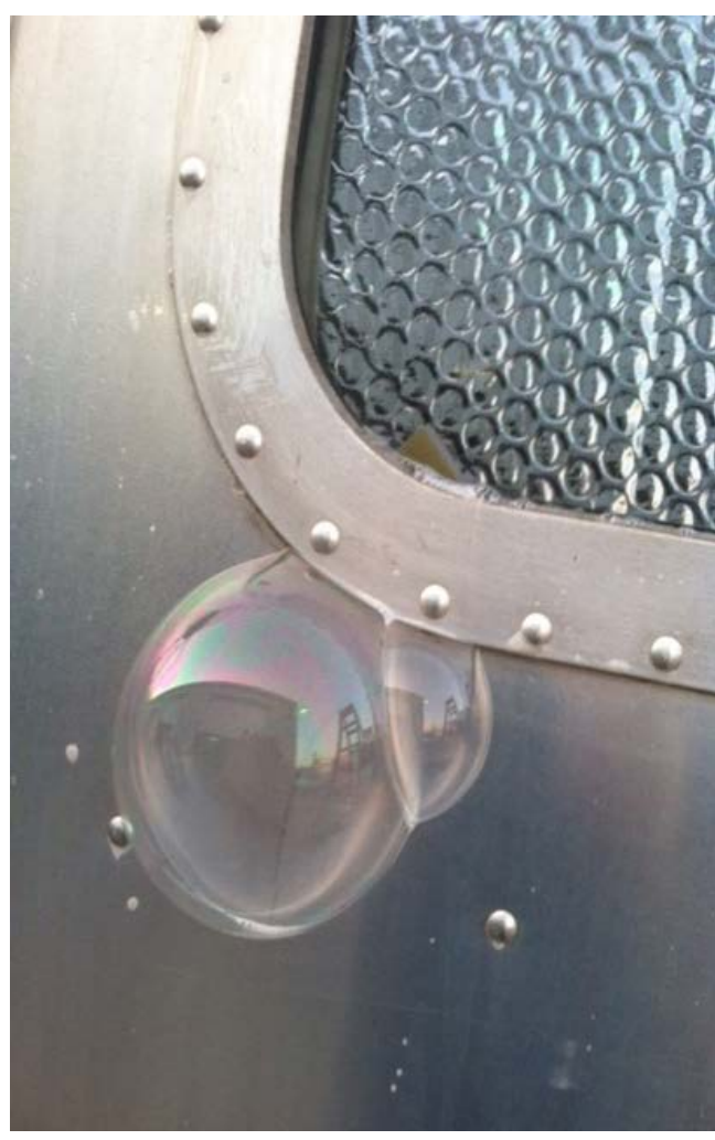
Seal Test Application