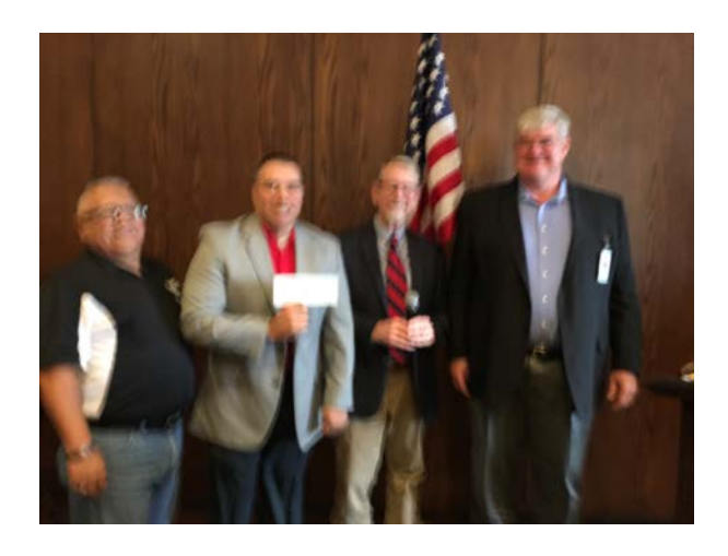
Team Red, White and Blue Contribution Check