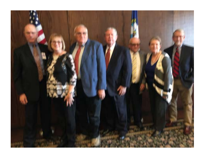
2017 TCPU Officers