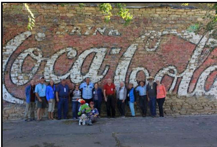
Enjoying the day in Quanah