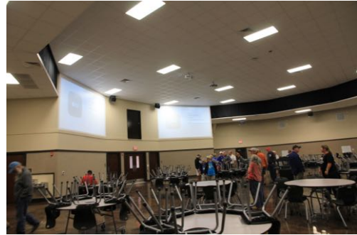
Interior of Safe Room/Cafeteria

The third trip was to one of the two Quanah Safe Rooms, a dome shaped storm shelter, which the Quanah school district constructed with the help of a government grant. The one we visited also served as a cafeteria for the high school. A second one across town serves as an elementary gymnasium. Great use of resources!