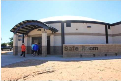
Exterior of Safe Room/Cafeteria

Another trip of interest was a star party adventure at the Three Rivers Foundation's observatory, Comanche Springs Astoronomy Campus. We were able to observe the Andromeda Galaxy, Mars, Venus, and Saturn through their telescopes without the interference of city lights. We were also fortunate enough to see the the International Space Station cross the night sky.