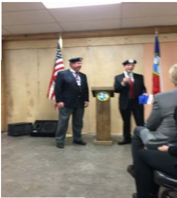
Passing The Torch