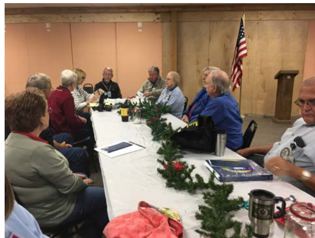
Board of Directors Meeting