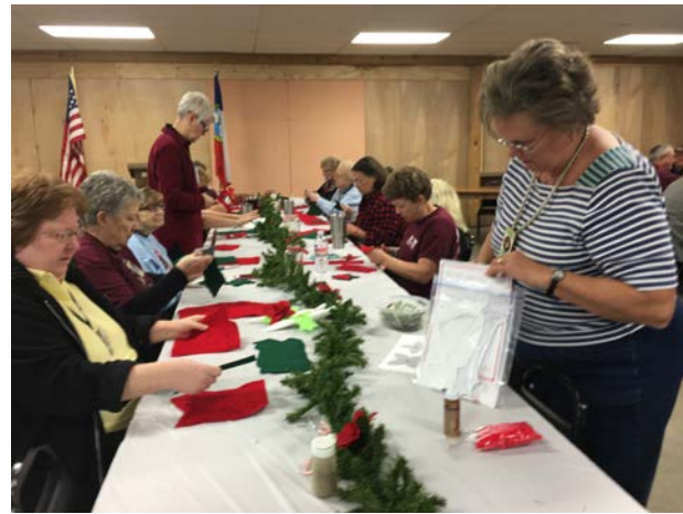
Crafts Session (Napkin Holders)